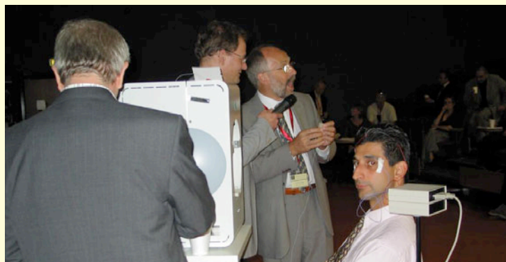
Wired for action during the ISCEV Course Demonstration