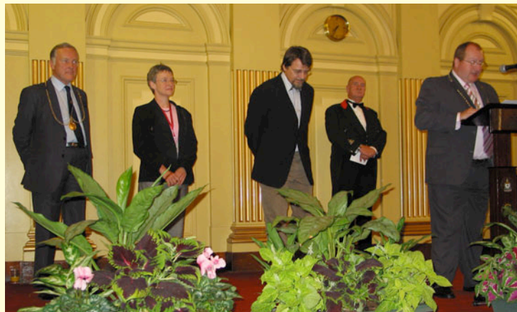
Opening night and the Victorian Splendor of the Glasgow City Chambers

It was a great honour for the ISCEV members of Glasgow to host the XLIII ISCEV Annual Symposium between 23 and 27 August 2005. This was the first ever ISCEV Symposium to be held in Scotland and it was pleasing that it was so well attended. We are indebted to all members of the local team who worked above and beyond the call of duty to make the meeting such a success.