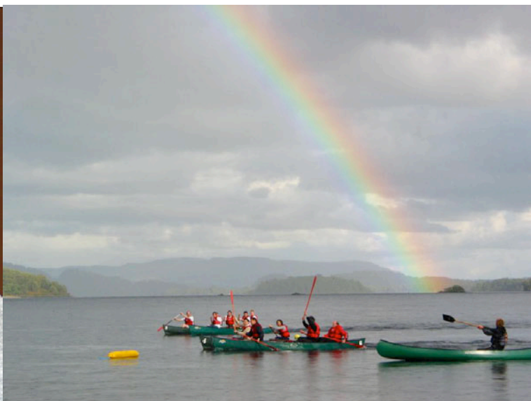
Enjoying the many aspects of Scottish hospitality