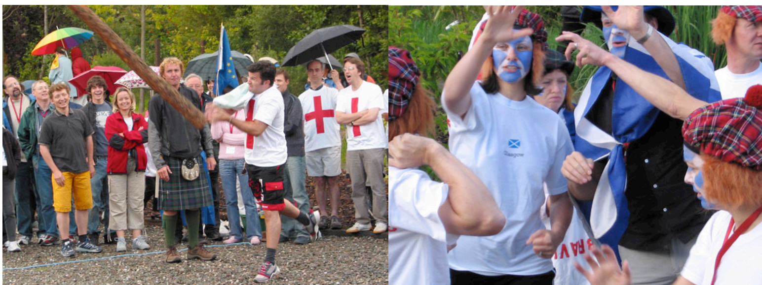
ISCEV Highland Games Games at Loch Lomond