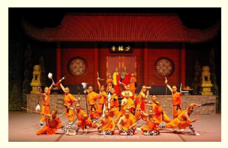
Shaolin Temple (Gongfu)