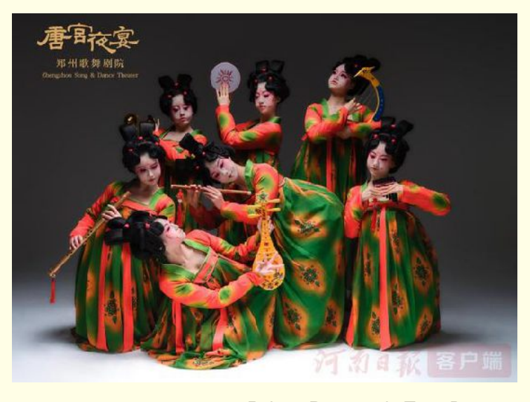
Palace Banquet in Tang Dynasty