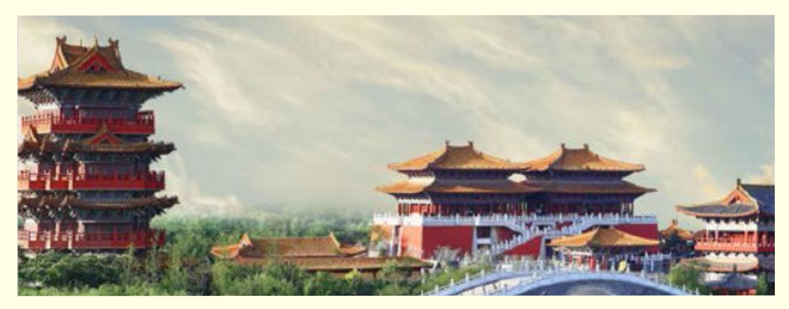
Qingming Riverside Landscape Garden

Organizers: Bo Lei, Ruifang Sui, Shiying Li