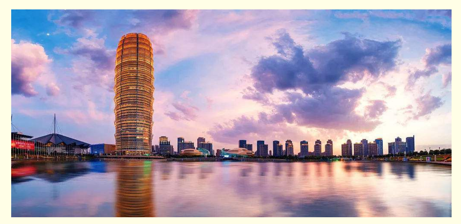
Zhengzhou International Convention and Exhibition Center