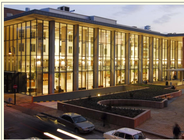
Basic Medical Science Center, Semmelweis Univ.