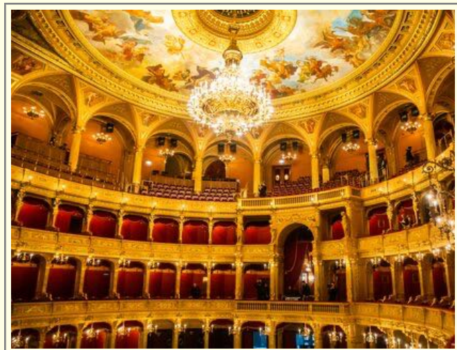
Opera House Budapest