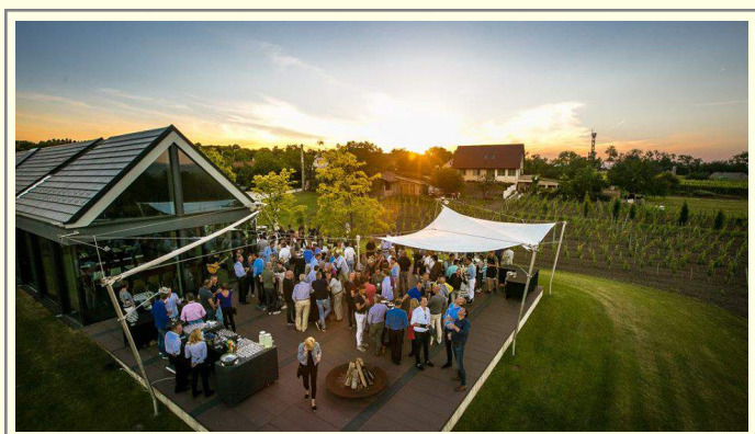
Eszterházy Etyeki Kúria (winery)