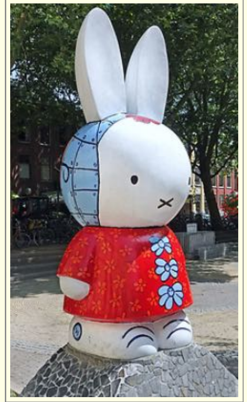
More photos from Utrecht, Netherlands